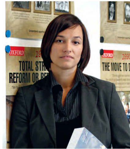
Prof. Nicole Deitelhoff Cluster of Excellence Normative Orders Peace Research Institute Frankfurt

Global politics is best conceived, we propose, not strictly as anarchy or hierarchy, but as a heterarchy where institutionalized power, or rule, assumes an array of guises, serves diverse functions and can be more or less concentrated or diffuse. We define rule as a structure of institutionalized super- and subordination that reduces contingency and stabilizes expectations. The initial intuition is that ontologically rule predicates resistance, such that power and hegemony are only thinkable and visible when they are contested. Thus, we propose a research programme that observes and theorizes rule by way of observing and theorizing resistance. To do so coherently in a broad range of contexts, we introduce a distinction between opposition and dissidence. Given the definition of rule as a structure of institutionalized super- and subordination, dissidence is the stronger form of dissent characterized by a rejection of the structure in toto. Opposition, by contrast, is resistance to particular manifestations of rule, such as policies or specific norms, while accepting the overall structure. This distinction is analytically valuable because it allows substantively normative features of rule, like authority and domination, to be brought back into the analysis but with an empirically informed, rather than a priori, foundation.